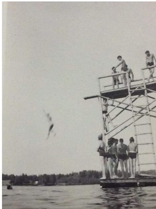
The Beach used to have a high dive!

Each site has its own picnic table and a little outdoor area, plus guests have the use of several acres of shared space and amenities around our campground and farm. Miles of public trails wind around to several natural beaches, Garrow Park playground, pickle ball courts, the Rowing Club and more. The opportunity to paddle Rabbit Lake and catch some fish will top off your experience.